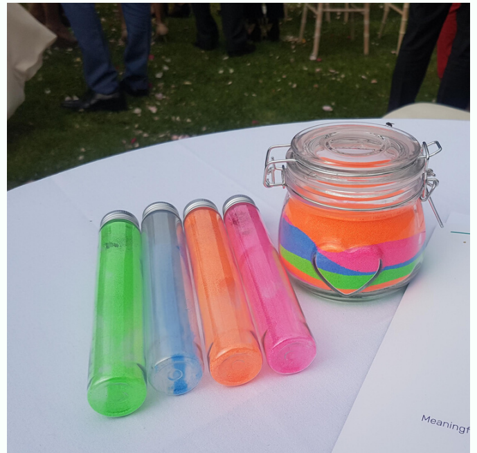
A sandblending is a fun way to represent the coming together of different families and is a great way to involve younger family members.

Beautiful vow cards, with colours and designs tailored to your style of wedding. You will also receive a presentation copy of your ceremony and, if you wish, a certificate to commemorate the day.