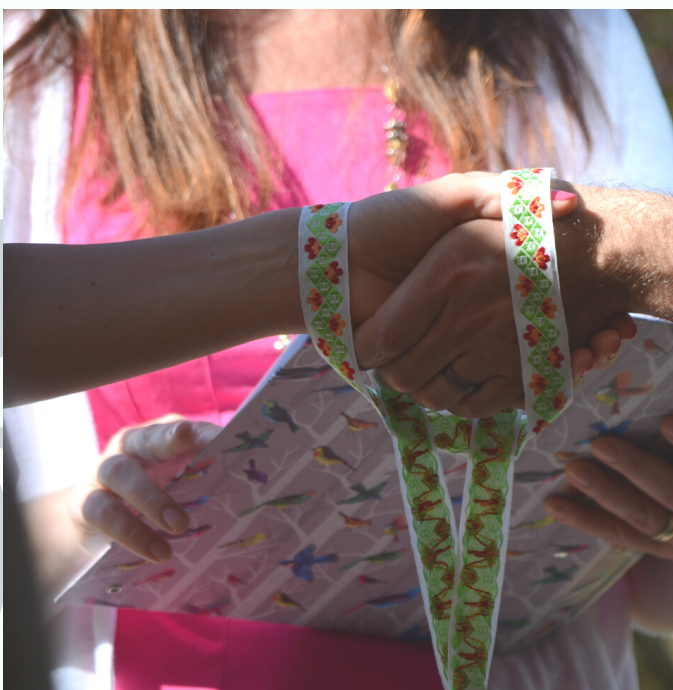
A handfasting can be carried out with one or more beautiful ribbons or cords.

I can advise on ideas for special symbolic gestures or rituals that can be included as part of your ceremony, whether it's performed indoors or outside. They can be a great way to involve guests or children.