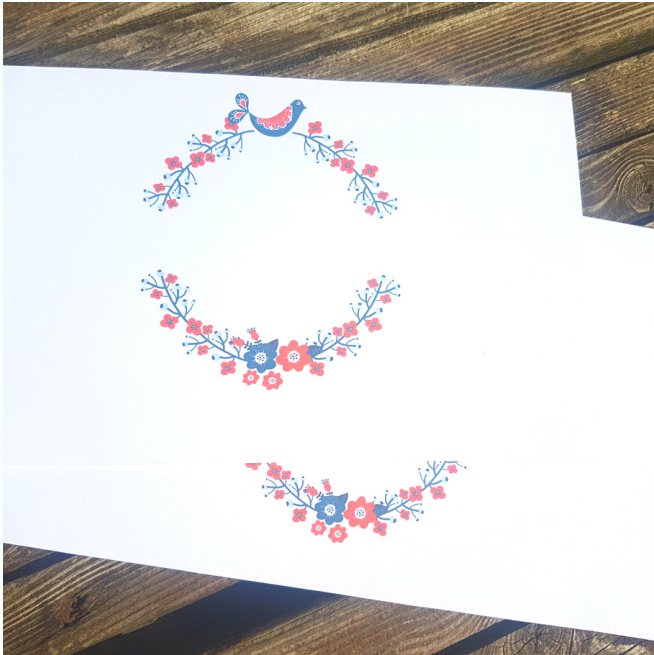
Vow cards to go with your style of wedding.

I can advise on ideas for special symbolic gestures or rituals that can be included as part of your ceremony, whether it's performed indoors or outside. They can be a great way to involve guests or children.